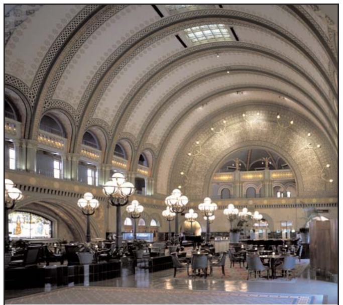
With its gold leaf, Romanesque arches, 65 foot barrel vaulted ceiling, and stained glass windows, the Grand Hall is the gem of the Union Station, a City as Text® site.

Join us as we explore St. Louis, get acquainted with one another, and share the experience and all it has to offer!