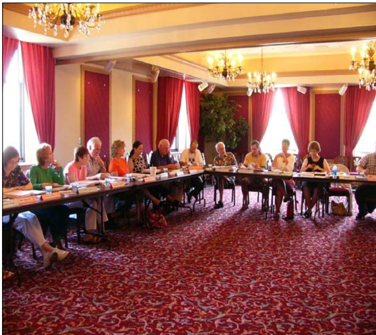
NCHC committee chairs and Executive Committee members discuss business and plan for the future during the recent mid-year meeting in Lincoln.