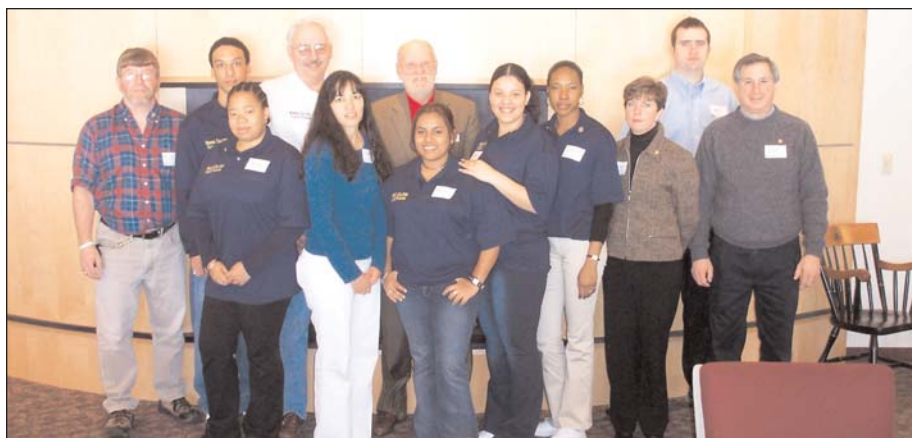
University of Maine at Augusta collaborates with Monroe College, N.Y., in hosting an NIF deliberative forum, "Globalization, Fear or Promise," in January.