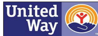
Mile High United Way to receive the proceeds from the silent auction